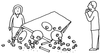
TABLES BUCKLING UNDER SHEER WEIGHT OF MINCE PIES