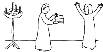
UNREST OVER THE CORRECT WEEK TO LIGHT THE PINK CANDLE