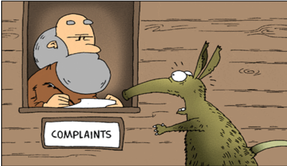
(See Genesis 6-8) 07-02-2010

TWO ANTS? YOU HAVE ONLY TWO ANTS?!? MY WIFE AND I EAT LIKE 100,000 PER DAY EACH!