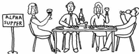
IT IS A SEASON OF ABSTINENCE AND FASTING