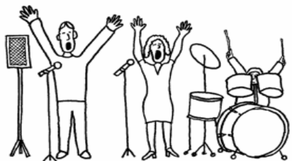
LENT IS A TIME FOR QUIET REFLECTION AND CONTEMPLATION